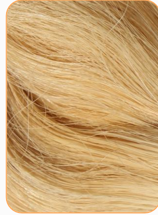
LIGHT GOLDEN BLONDE