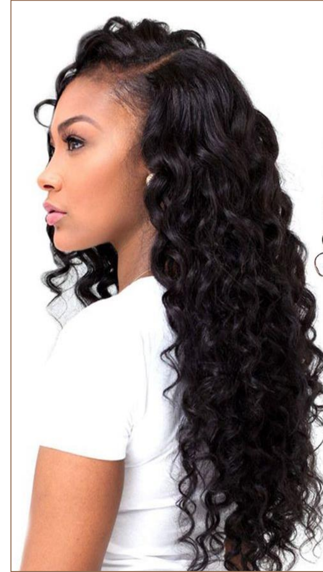
Indian Deep Wavy Hair