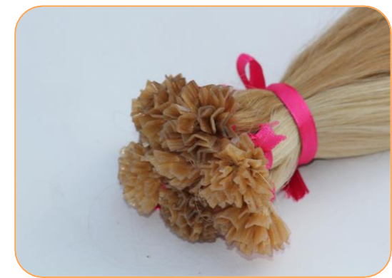
KERTAIN TIP – V TIP