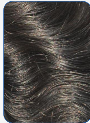
NATURAL COLOR 1B