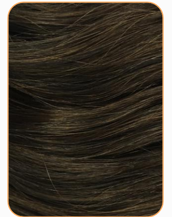
NATURAL COLOR 2