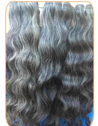
GREY - WAVY