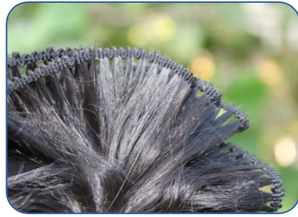
HAND TIED WEFT

We understand each customer's need and we work in close association with them to supply quality Indian Human Hair. Our team procures only the Best Quality Human Hair from various Temple Auctions of South India and processes it to give an excellent finish.