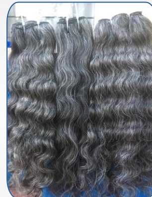
GREY - CURLY