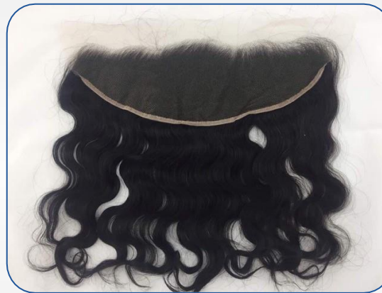
13 x 4" Frontal