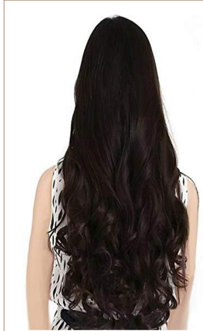
Indian Wavy Hair