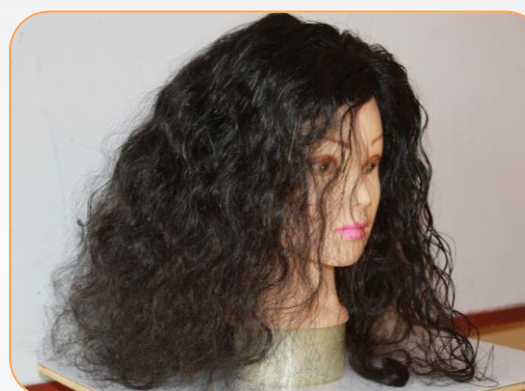
4 X 4" WIG