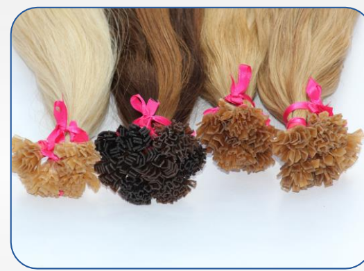
KERTAIN TIP – U TIP