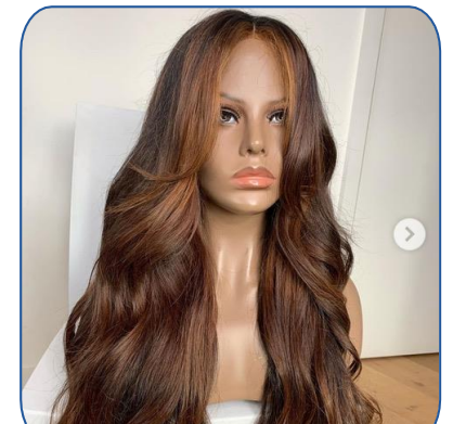
LACE FRONT WIG