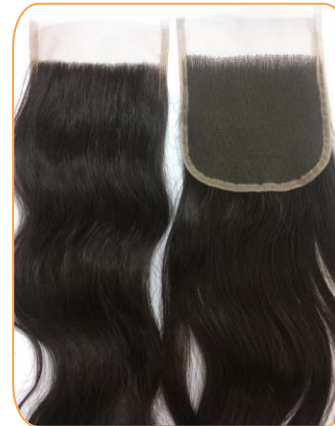
4 x 4" closure