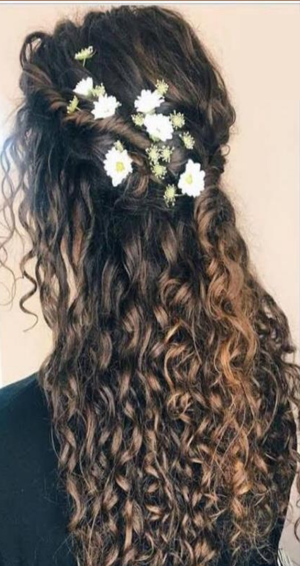
Indian Curly Hair