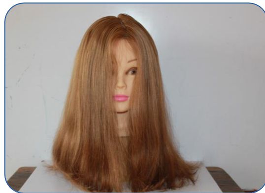
FULL LACE WIG