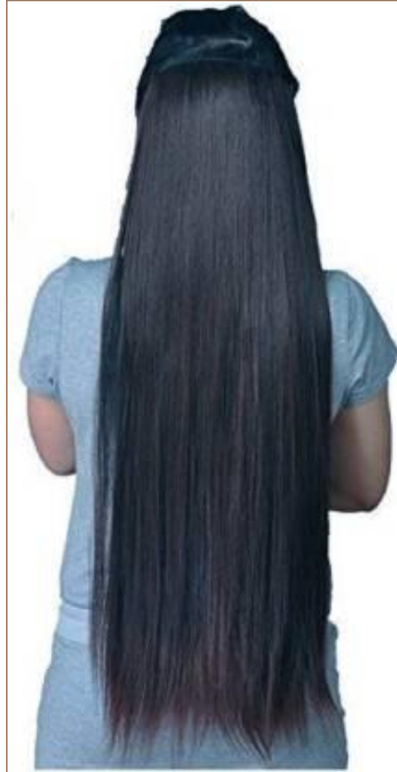
Indian Straight Hair