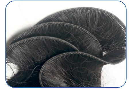
MINI MICRO WEFT – 3 THREAD