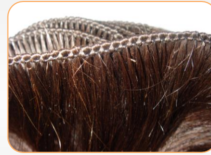
MICRO WEFT – 3 THREAD