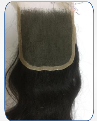
5 x 5" closure