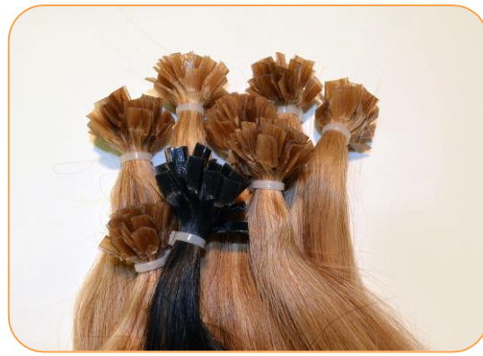
KERTAIN TIP - FLAT TIP

N.B. Please note that all our products are made for customer order in our factories, and we don't have any online shop. The delivery time for each product is subject to its availability and production time.